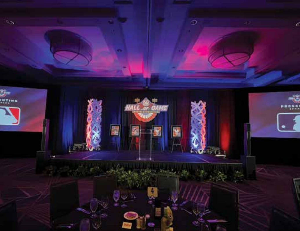
Above: The Negro League Baseball Museum's Hall of Game Event Event-Driven Graphics | Substrate: 3/16" Ultraboard