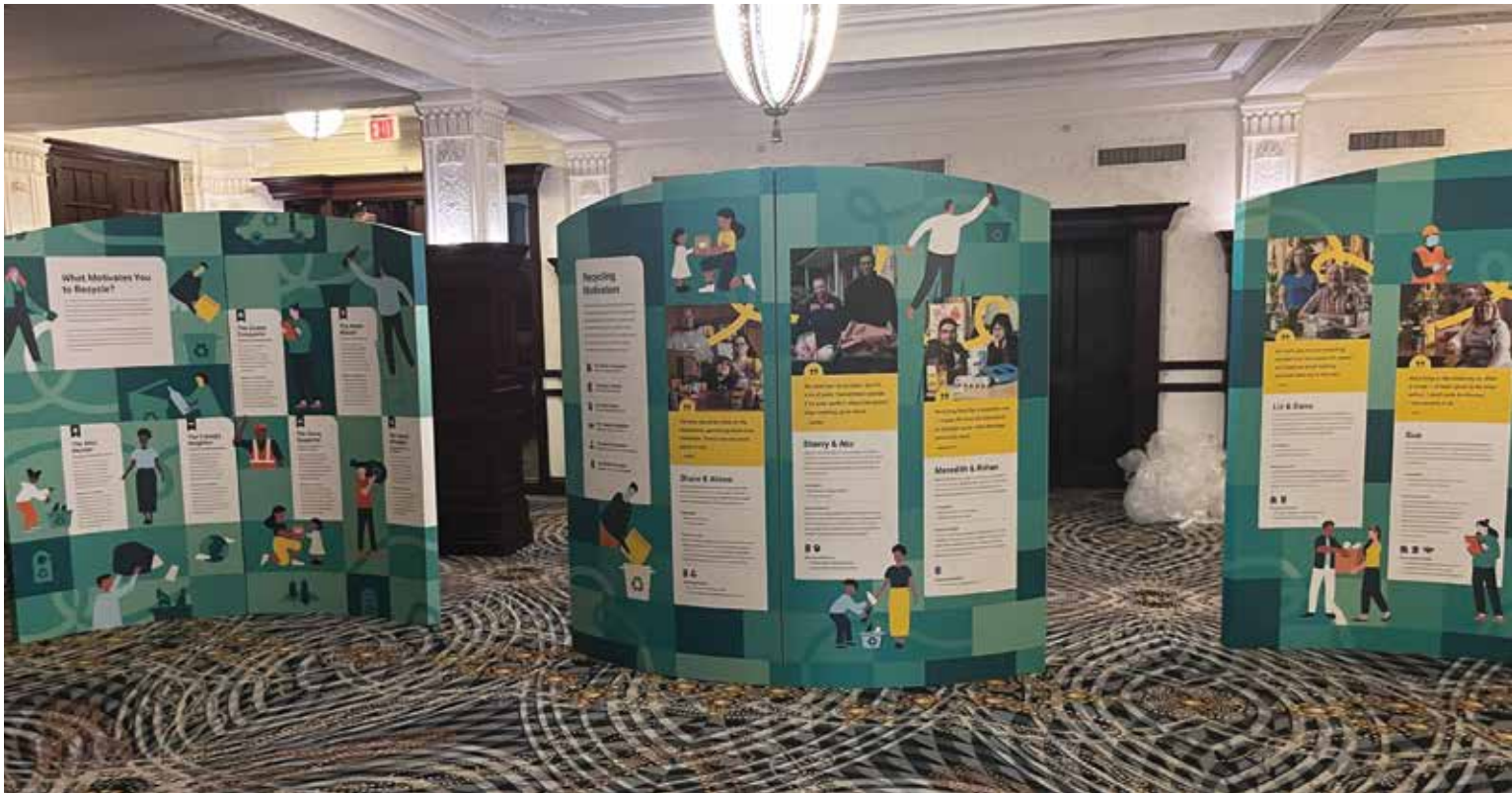
Right: Recycling Convention Event-Driven, Environmental Graphics Substrate: Corrugate