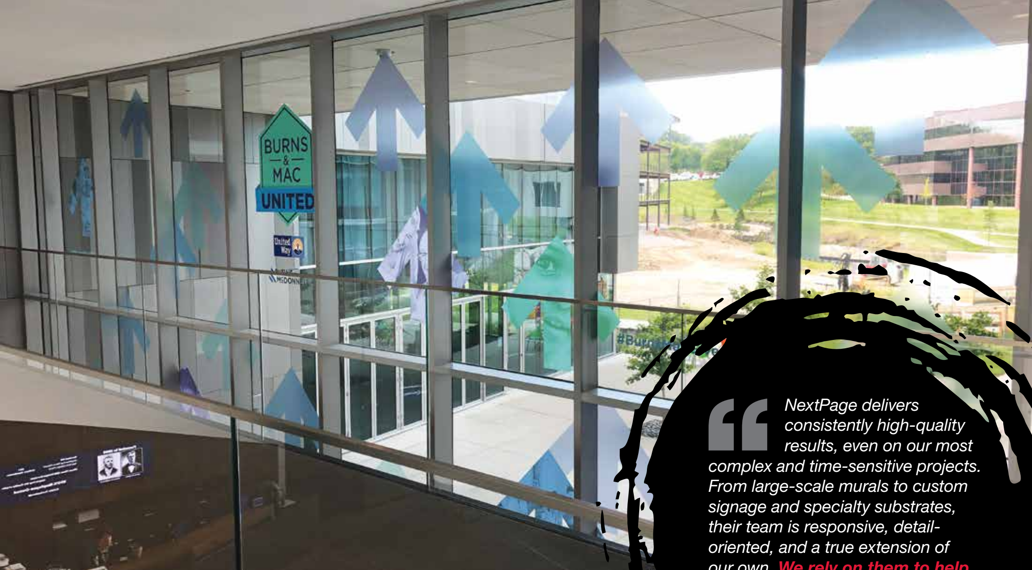
Above & Page Left: Burns & McDonnell United with United Way Event-Driven Window Graphics | Substrate: Wallmark 6 mil Matte White Calendered Vinyl Film

“ NextPage delivers consistently high-quality results, even on our most complex and time-sensitive projects. From large-scale murals to custom signage and specialty substrates, their team is responsive, detail-oriented, and a true extension of our own. We rely on them to help bring our exhibitions to life—on time and on brand. ”