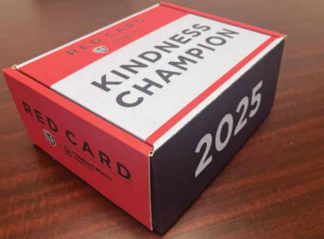
Left: Childrens Mercy Hospital Red Card Kindness Carton Cartons & Packaging | Substrate: Corrugate