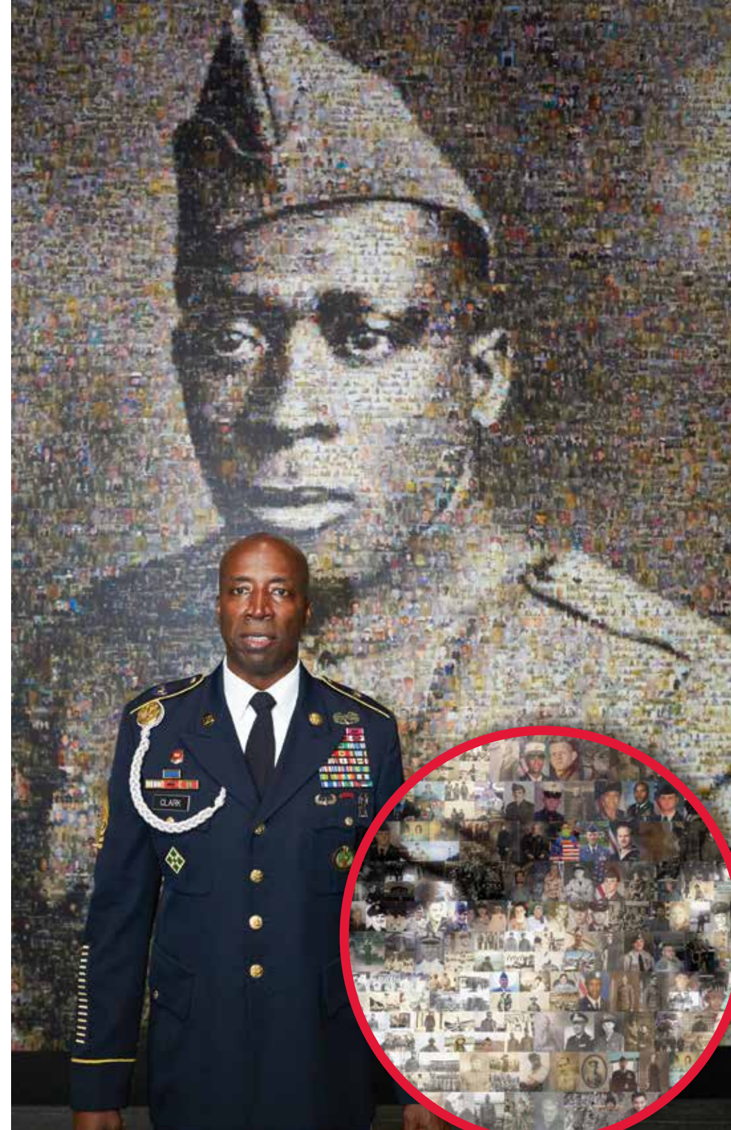
Right: The National WWI Museum and Memorial with The People's Picture, Inc.