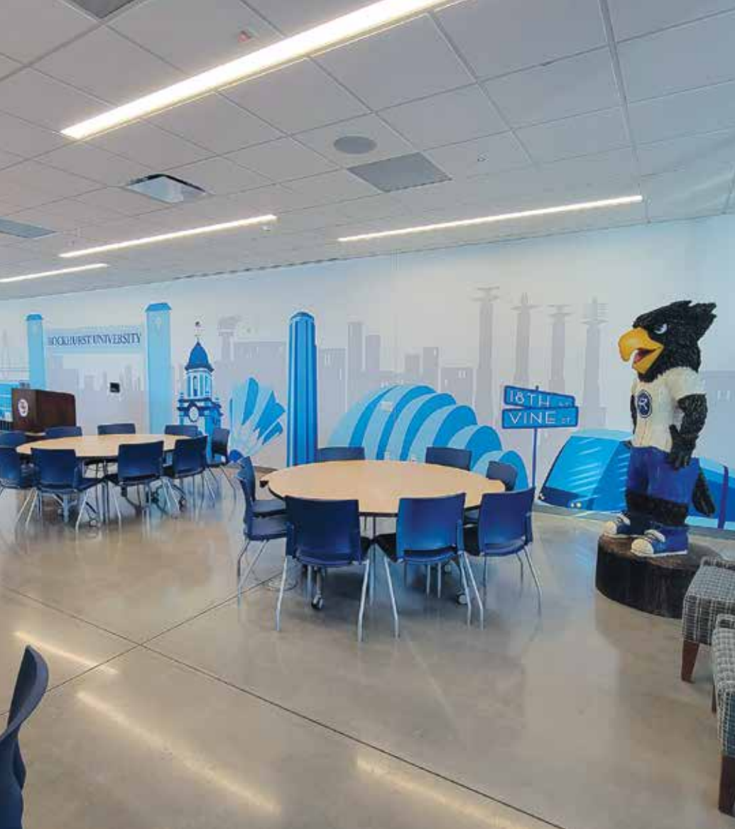
Page Left: Kansas City Zoo

Donor Wall Graphics | Substrate: M Series 50 Graphic Vinyl White Matte