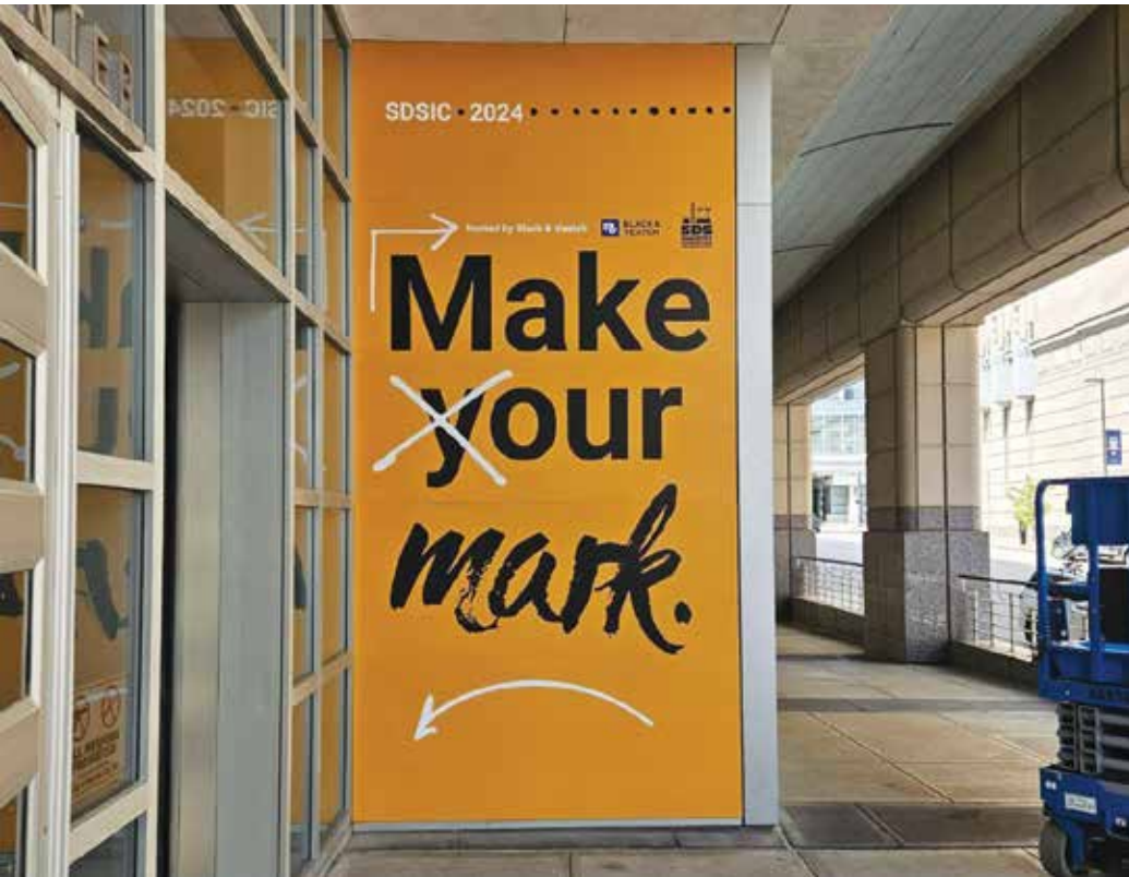
Above: Black & Veatch at the 2024 SDSIC Tradeshow Custom Wall Graphic | Substrate: 3mm White PVC