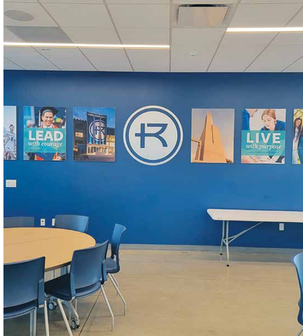
Above: Rockhurst's Conway Hall Custom Mural & Graphics Custom Wall Graphics | Substrate: 3M Series 50 Graphic Vinyl White Matte

Donor Wall Graphics | Substrate: M Series 50 Graphic Vinyl White Matte