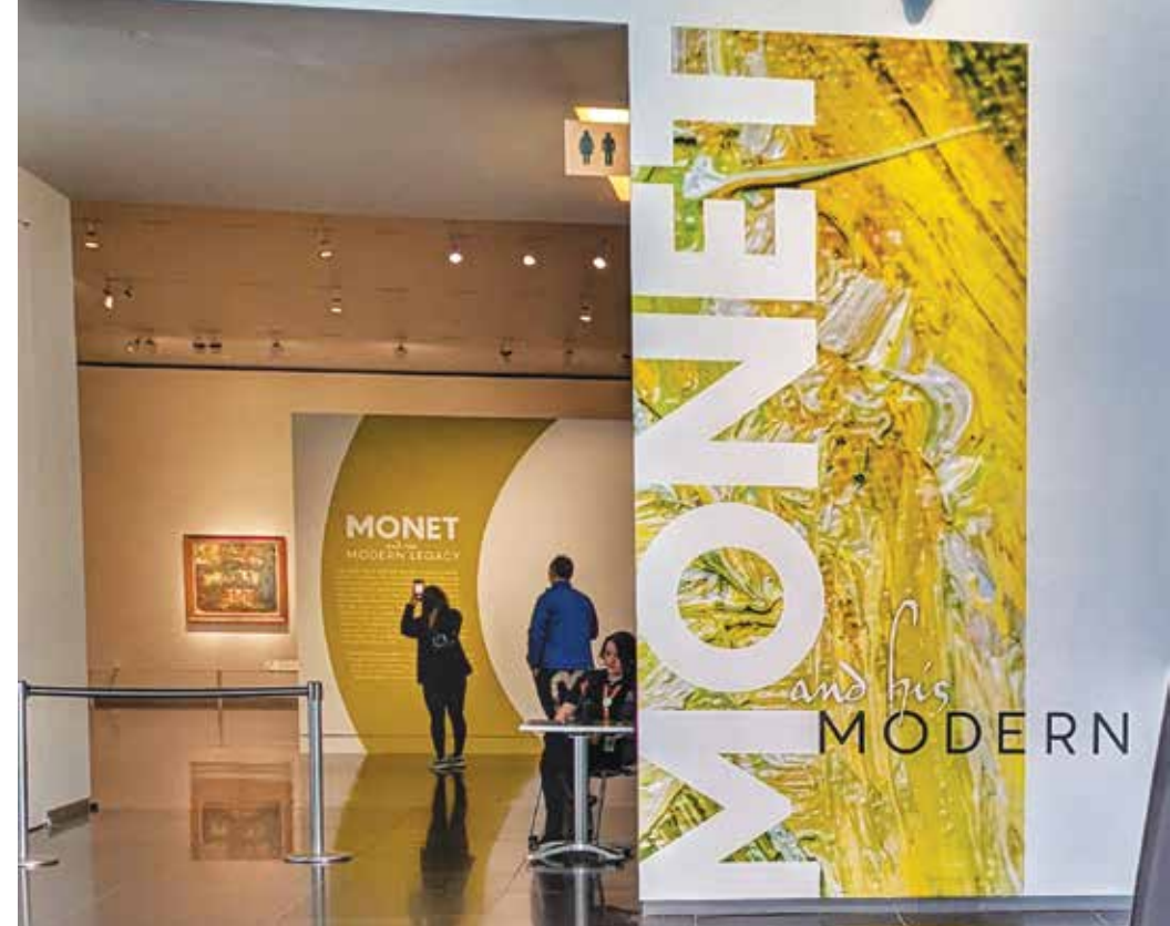
Above: The Nelson-Atkins Museum of Art Monet Exhibit

Custom Wall Graphic | Substrate: 3M Ultra-Matte Cast Laminate and 3M Cast Vinyl